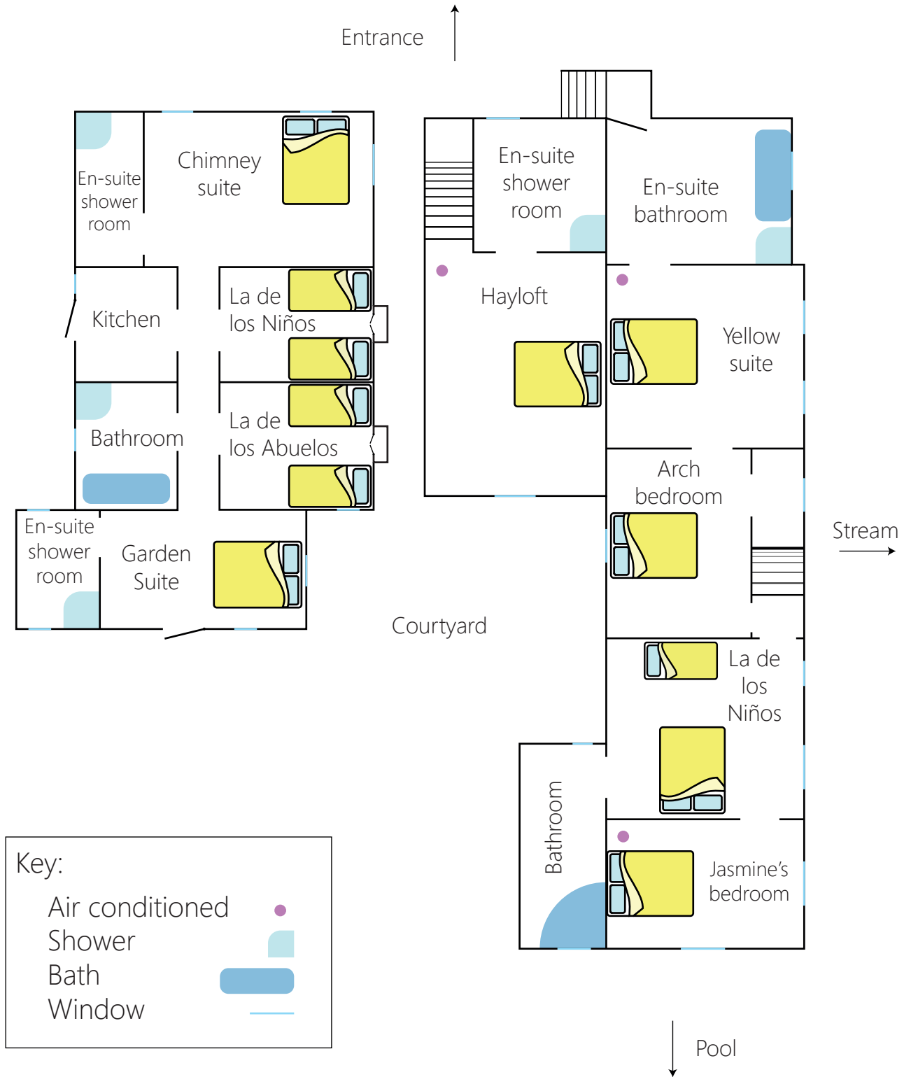
El Molino Viejo (1st floor)